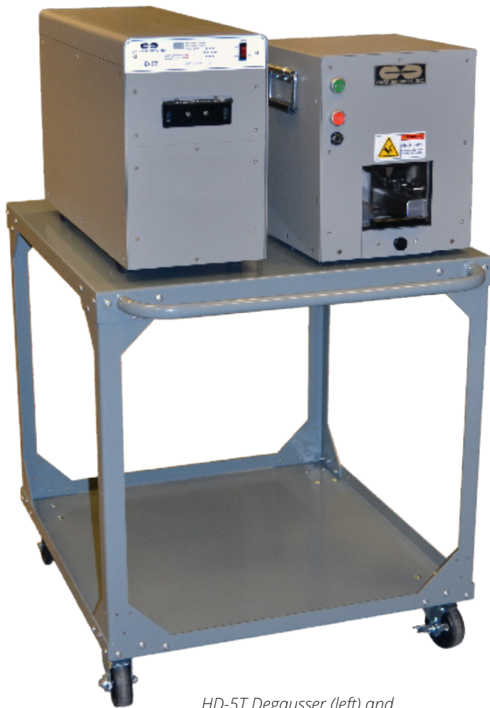
HD-5T Degausser (left) and DB-4000 Destruction Device (right) shown on the Degauss and Destroy Utility Cart.

Multiple Award Schedule (MAS) Contract Holder SIN 339940