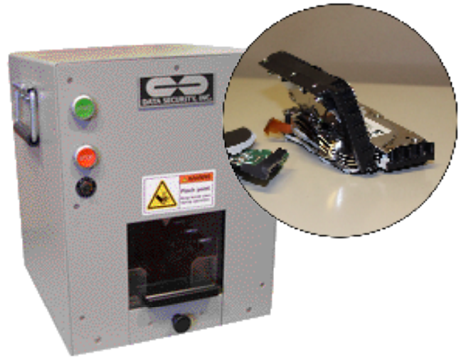
DB-4000 DESTRUCTION DEVICE